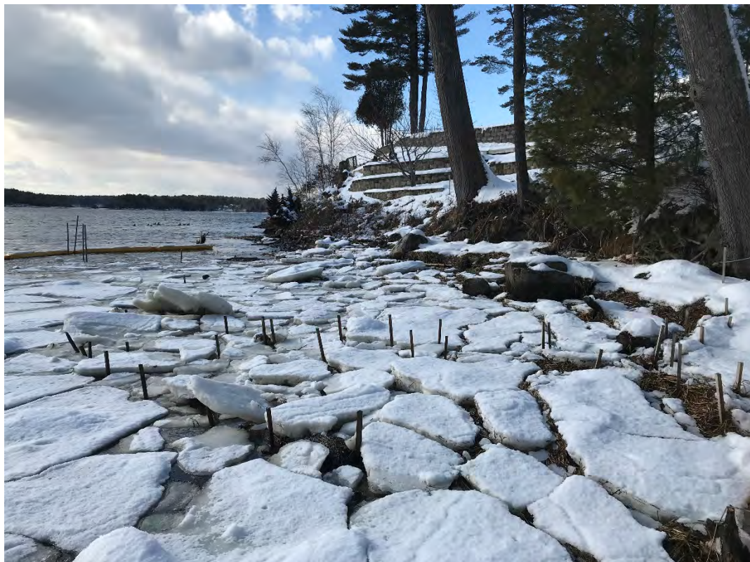
Fig 12: Salt marsh restoration at Gundalow Landing/east side of the bay. Viewing northwest. (02-10-21)