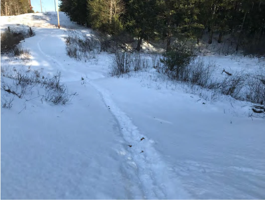
Fig 7: Stream DS46 between Strs. 51 and 52. Viewing northeast. (02-10-21)