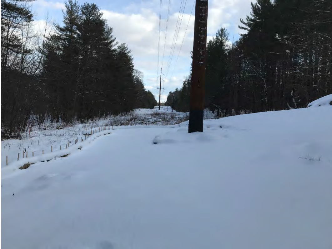
Fig 5: Str. 89 work area. Viewing southeast. (02-10-21)