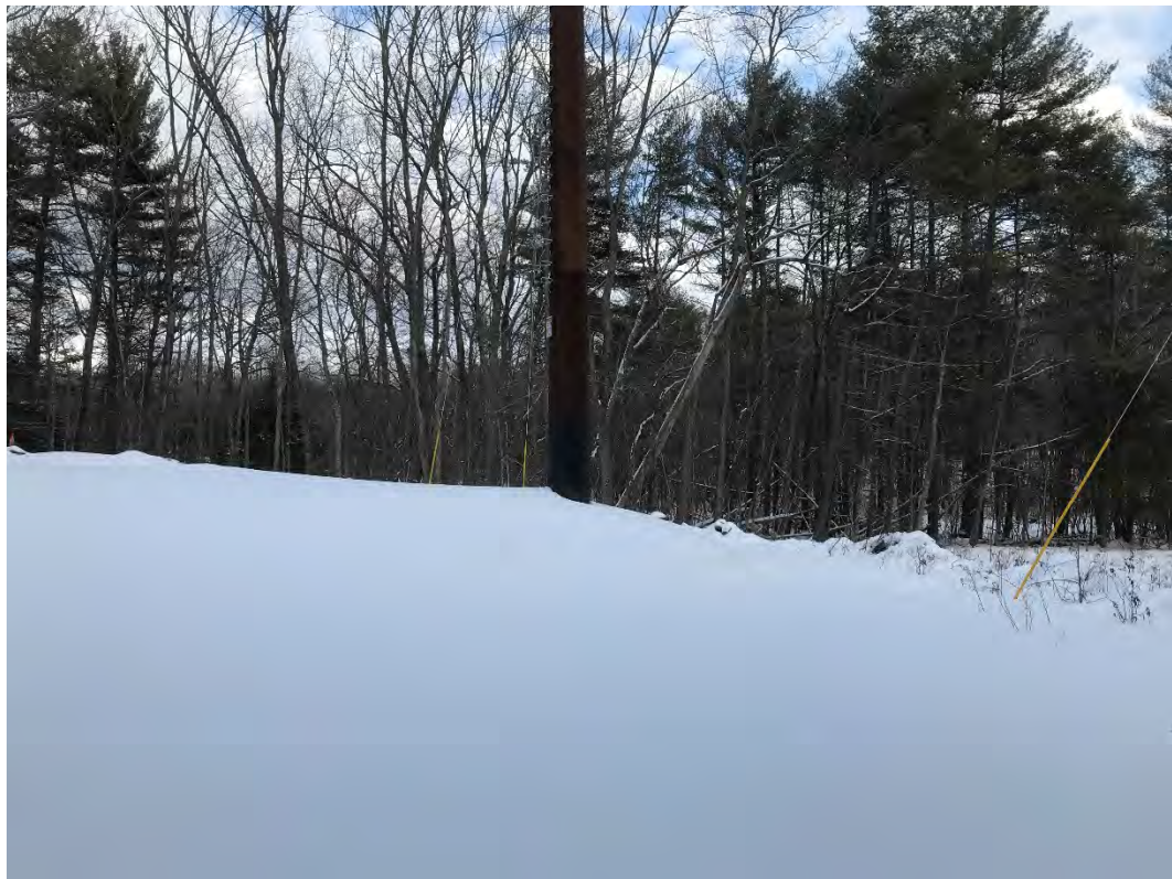
Fig 6: Str. 90 work area. Viewing northeast. (02-10-21)