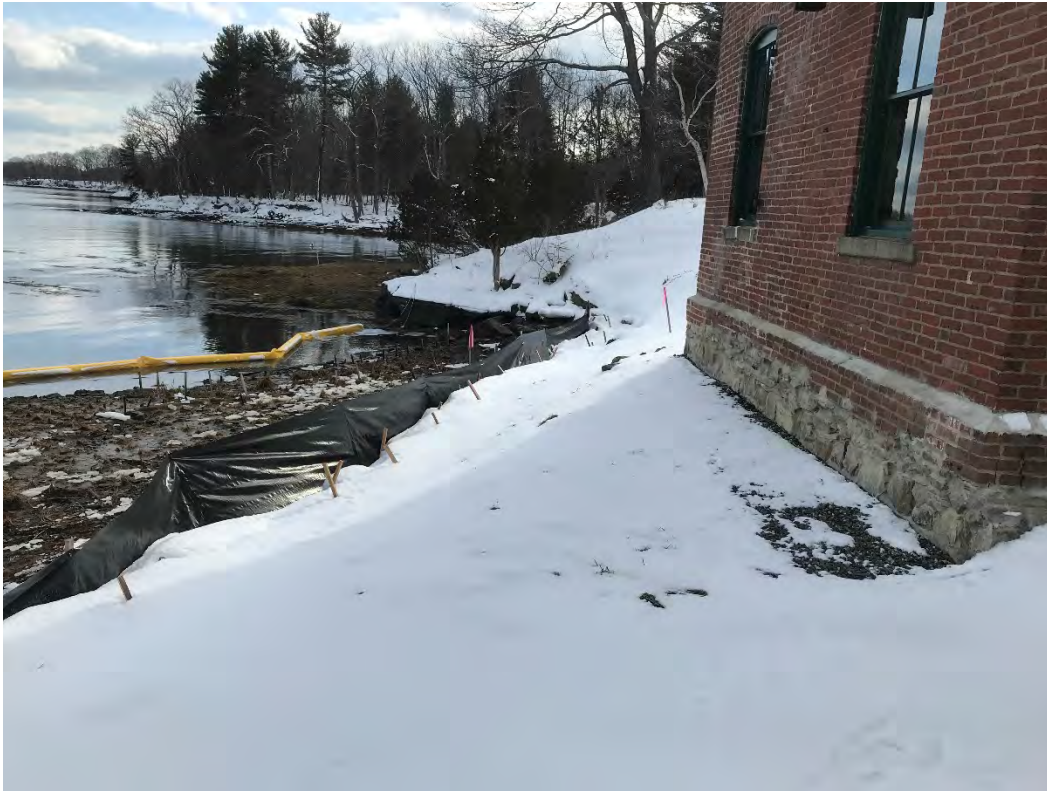
Fig 2: Slope between the cable house and salt marsh restoration at the Eversource property/west side of the bay. Viewing south. (02-10-21)