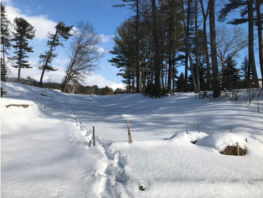
Fig 9: Slope above the manhole at Gundalow Landing/east side of the bay. Viewing east. (02-10-21)