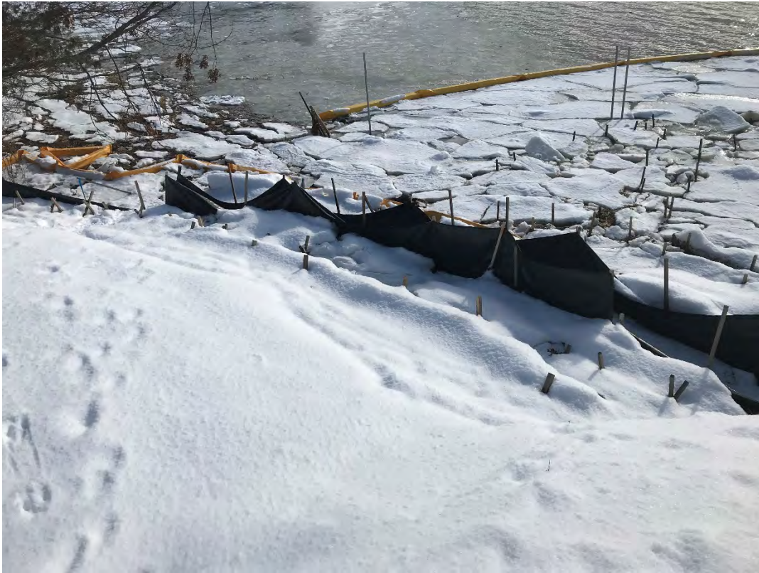
Fig 11: Toe of the slope at Gundalow Landing/east side of the bay. Viewing south. (02-10-21)