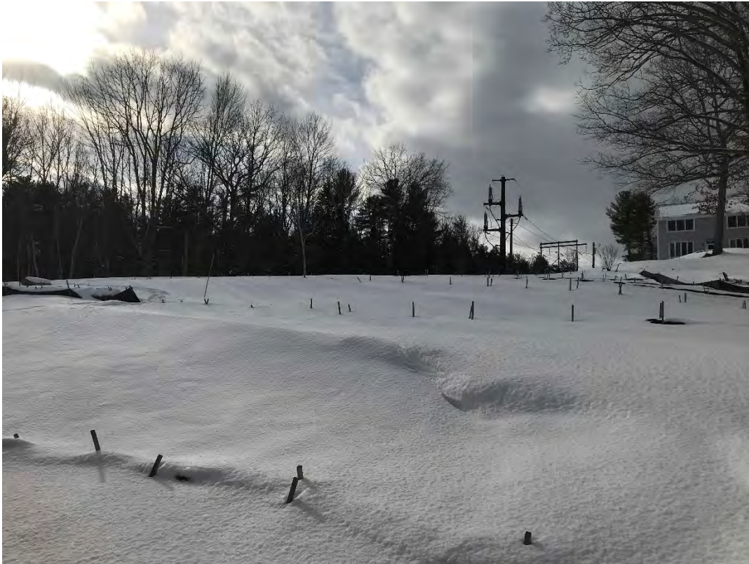
Fig 3: Slope above the cable house at the Eversource property/west side of the bay. Viewing southwest. (02-10-21)