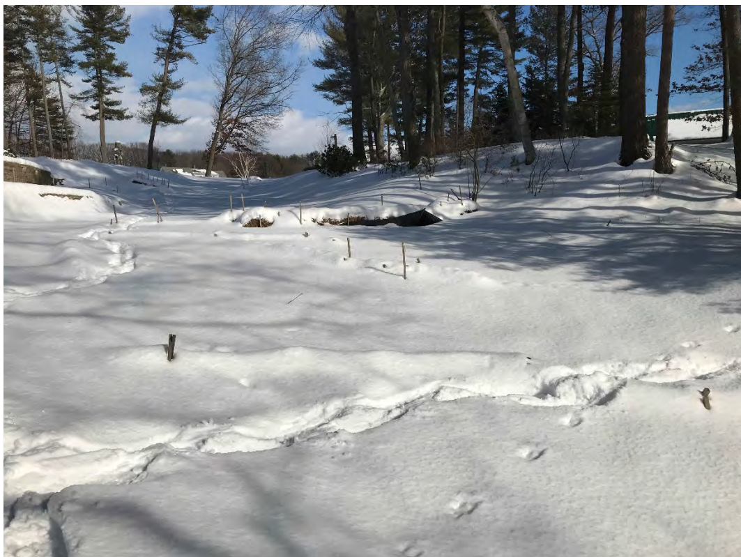
Fig 10: Slope below the manhole at Gundalow Landing/east side of the bay. Viewing east. (02-10-21)