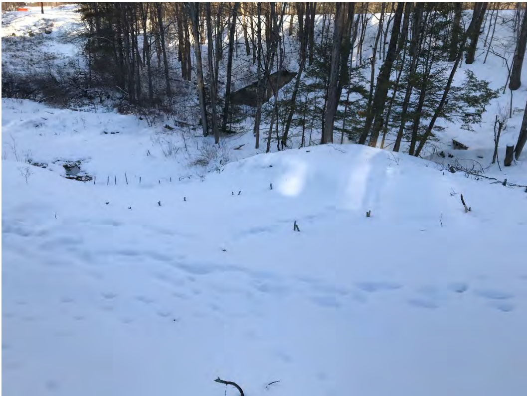
Fig 8: Lower portion of slope between Strs. 28 and 29. Viewing northeast. (02-10-21)