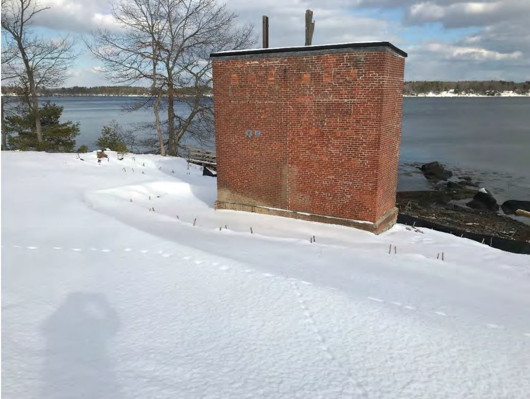
Fig 1: Slope leading down to cable house and salt marsh restoration at the Eversource property/west side of the bay. Viewing northeast. (02-10-21)