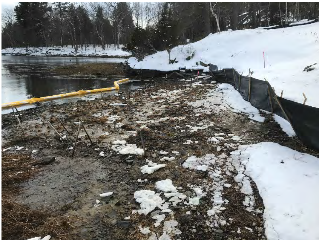
Fig 4: Toe of the slope and salt marsh restoration at the Eversource property/west side of the bay. Viewing south. (02-10-21)